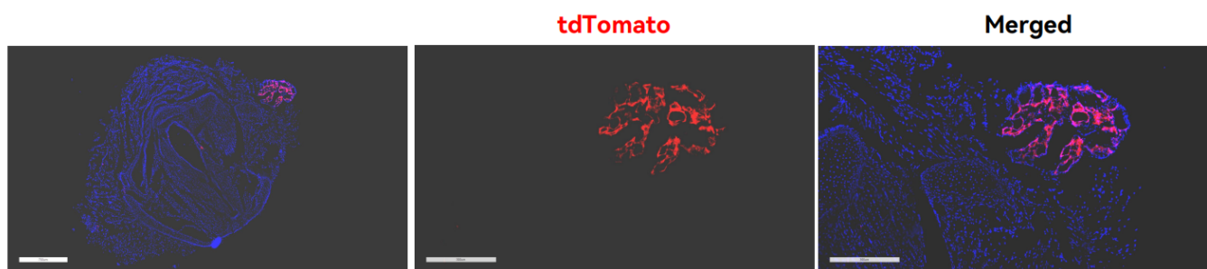
Fig2. Cre-mediated recombination in thyroid of Pax8 Cre/+ ; Rosa26 tdTomato/+ mouse.